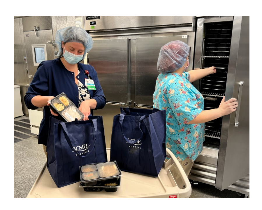
ACMH Dietary professionals preparing care packages