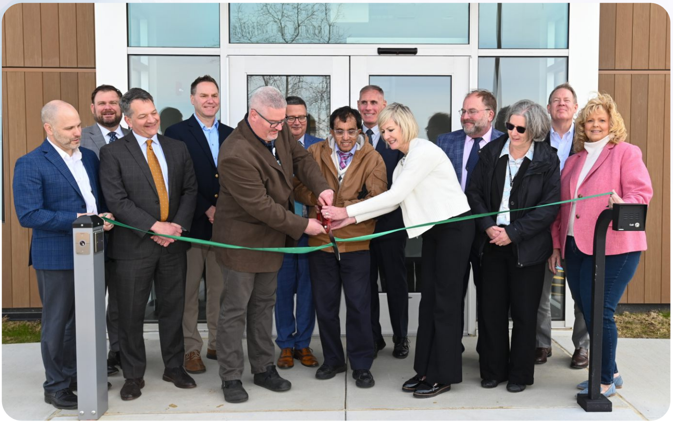
A formal ribbon cutting was held on April 9, 2025 to commemorate the completion of the new facility.

The new facility is also set to address some of the region's most pressing public health challenges. Given the prevalence of drug addiction and the lack of primary care providers in the service area, IRMC Mountains Behavioral Health is not just focused on treating mental health issues, but also helping to break the cycle of substance abuse and other health disparities. The ability to treat these issues in a more coordinated, local setting will help improve outcomes and reduce the burden on emergency services.